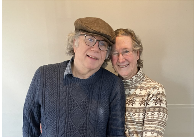
Retiring after 25 years of ordained ministry.